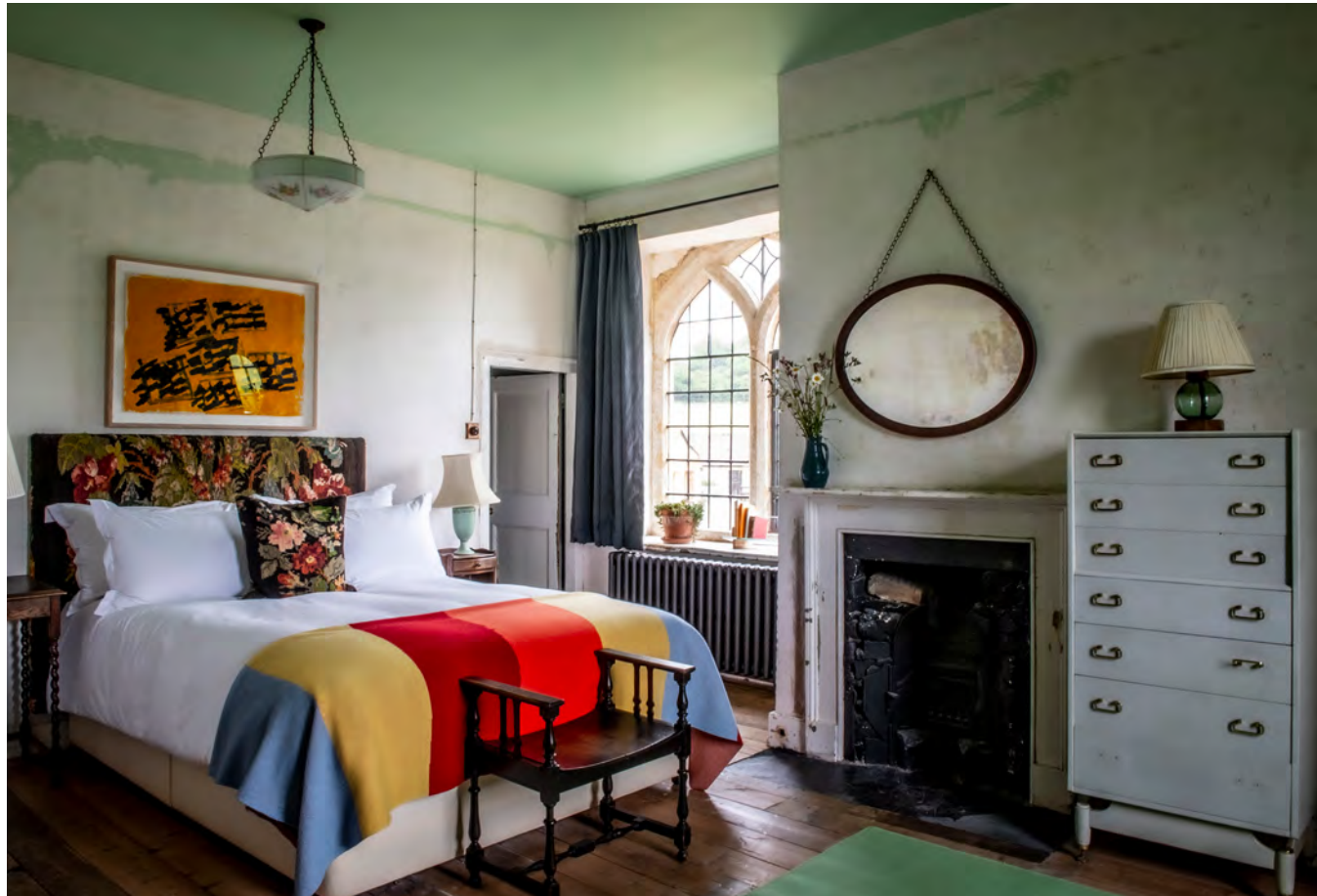
Phyllida Barlow, untitled: Joodlights, 2011